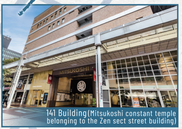
141 Building (Mitsukoshi constant temple belonging to the Zen sect street building)